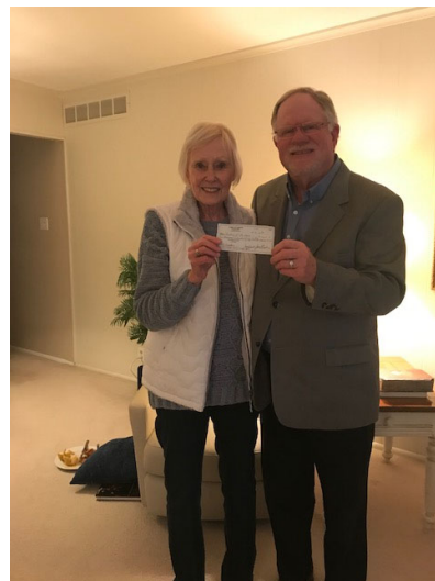
ST. LOUIS ACADEMY DONATION