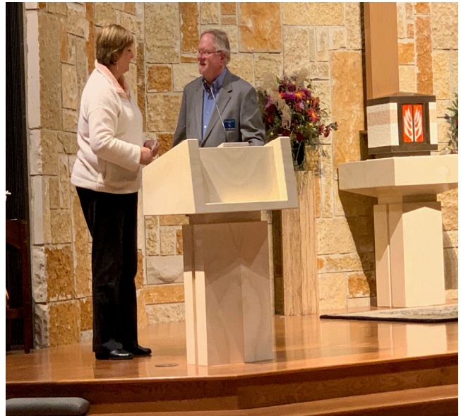
INCARNATE WORD SCHOOL ONE CLASSROOM PROGRAM DONATION