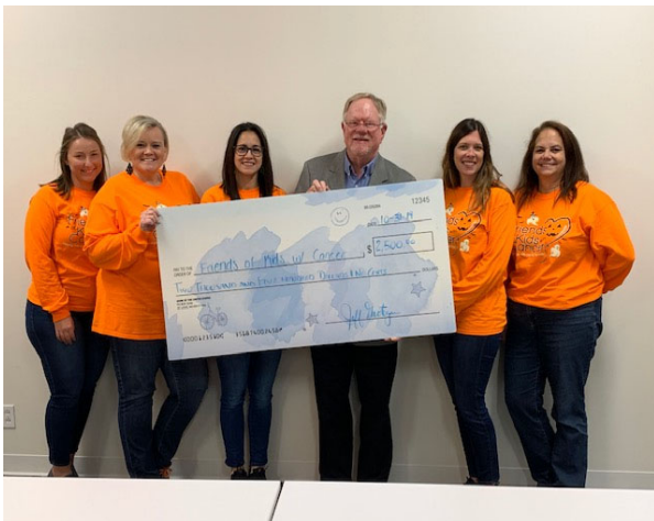
FRIENDS OF KIDS WITH CANCER DONATION